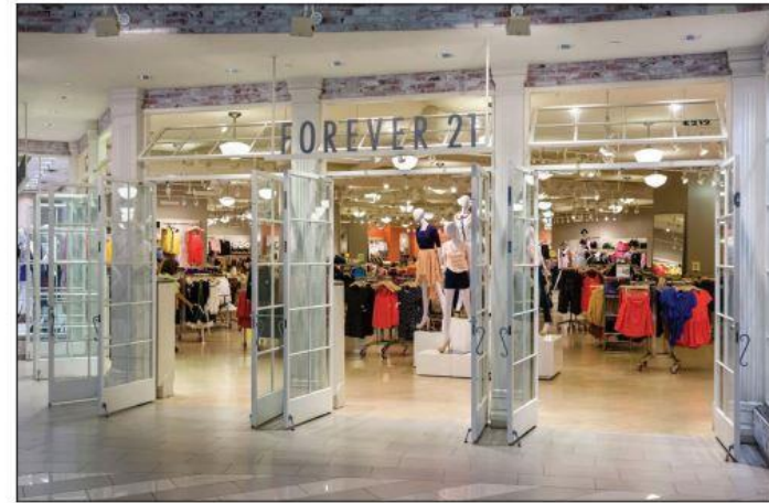
An increasing number of malls are using exciting stores like Forever 21 to attract younger customers.

Shopping malls are enclosed, climate-controlled, lighted shopping centers with retail stores on one or both sides of an enclosed walkway. Parking is usually provided around the perimeter of the mall