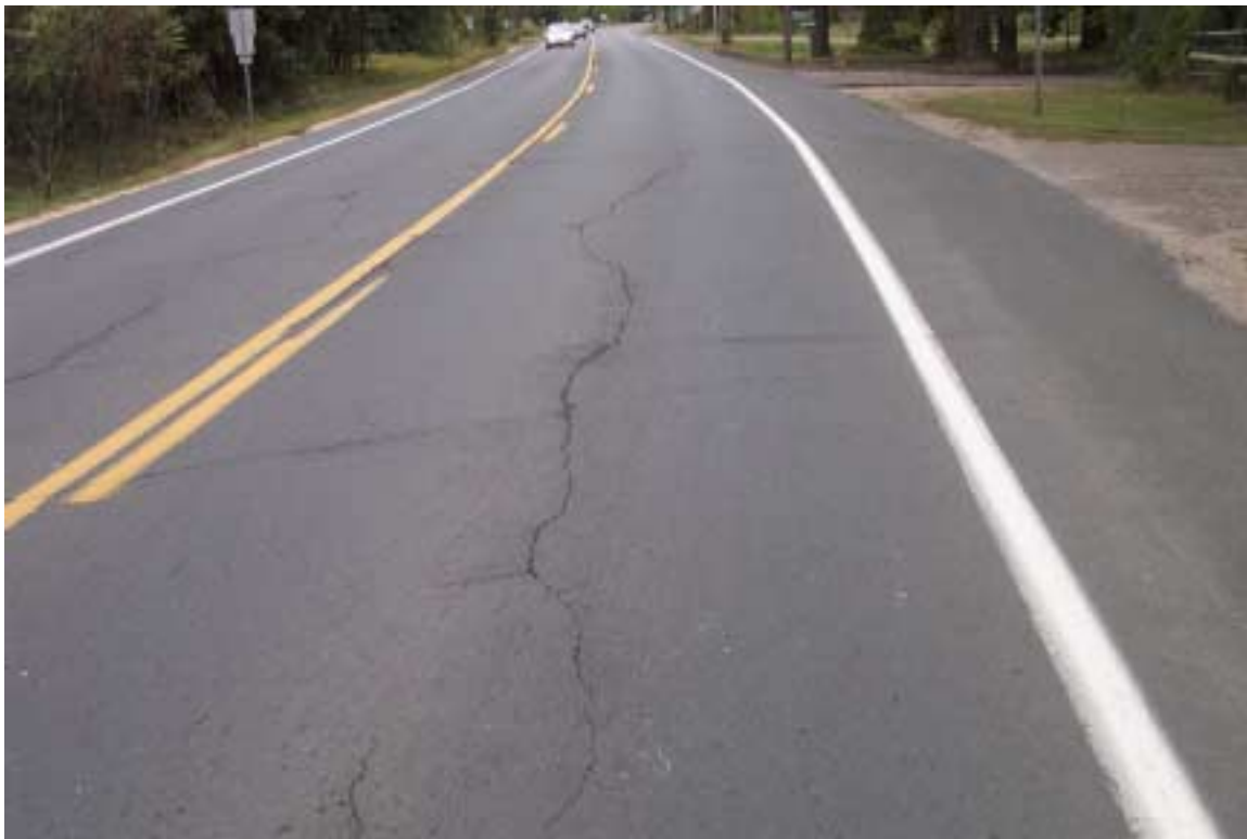
Figure 8. Low Severity Longitudinal Crack

Record the length, in feet, of longitudinal cracking at each severity level.