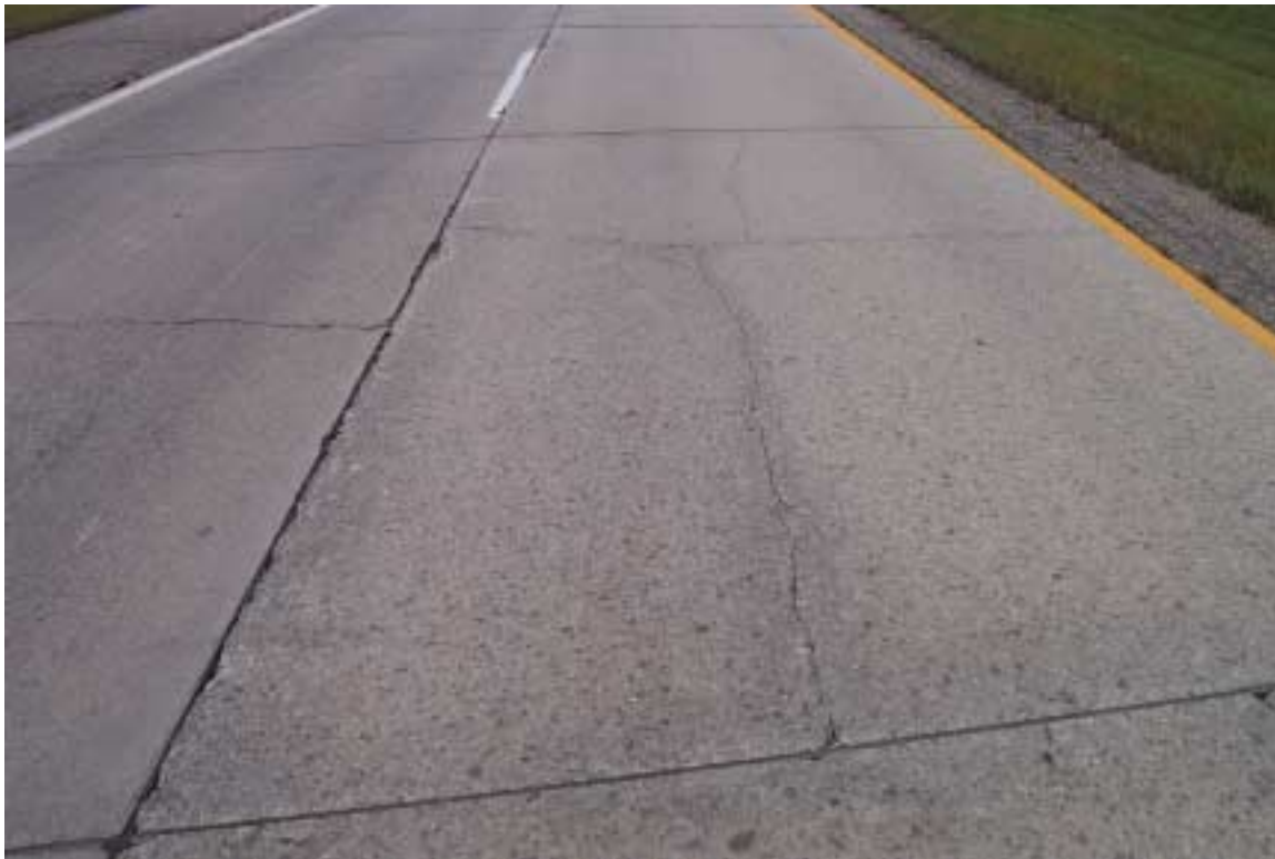
Figure 34. Cracked and Broken Panel

Record the number of slabs that are broken.