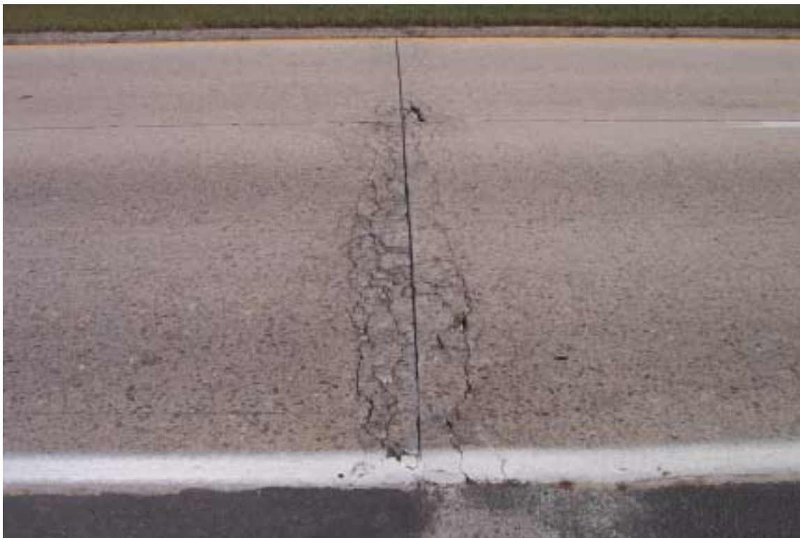
Figure 43. D-Cracking