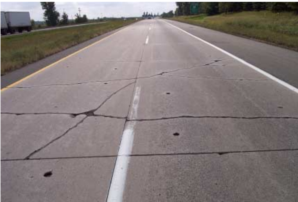
Figure 36. Cracked and Broken Panel