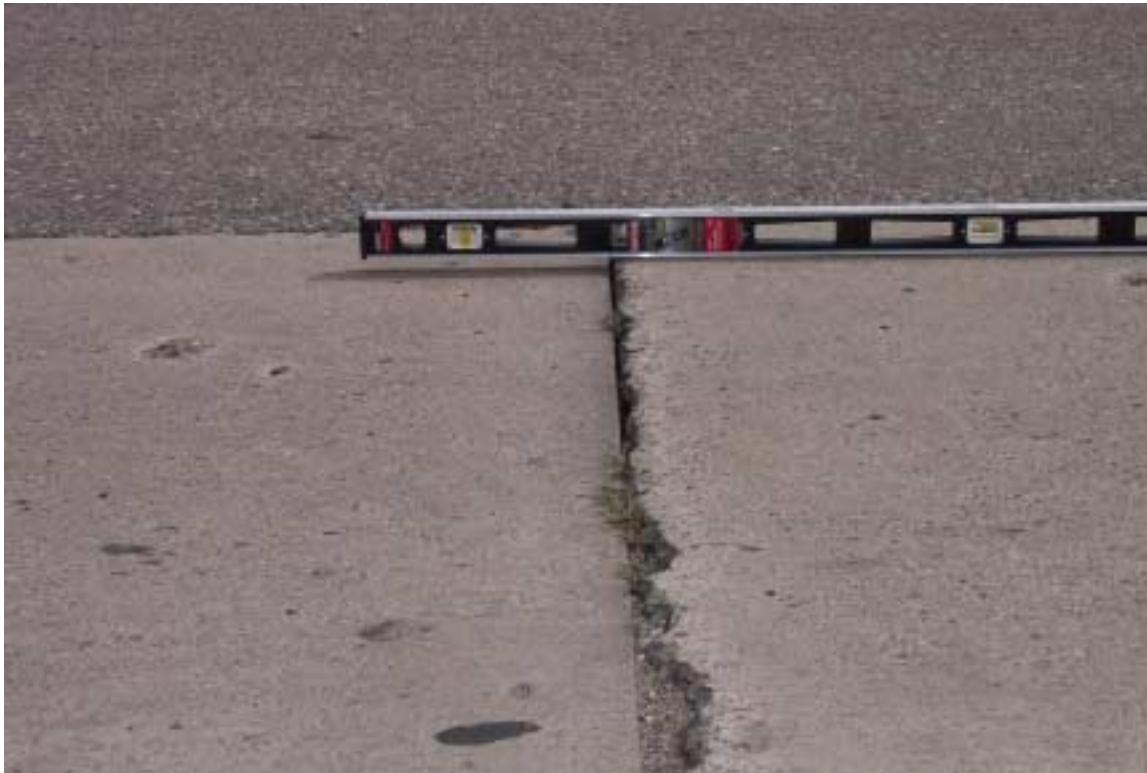
Figure 32. Faulted Joint

Record the number of transverse joints that exceed the 0.25-inch criteria at any point along its length.