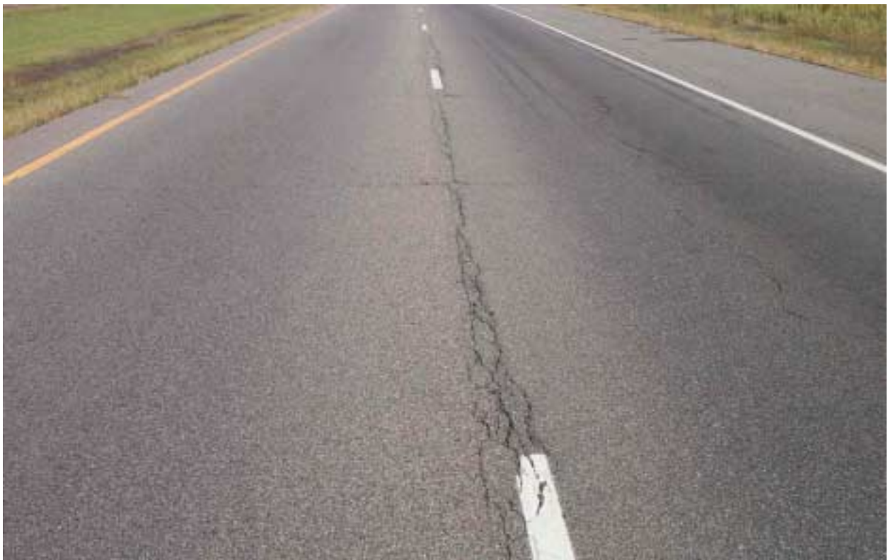
Figure 14. Medium Severity Longitudinal Joint Deterioration (random cracks)