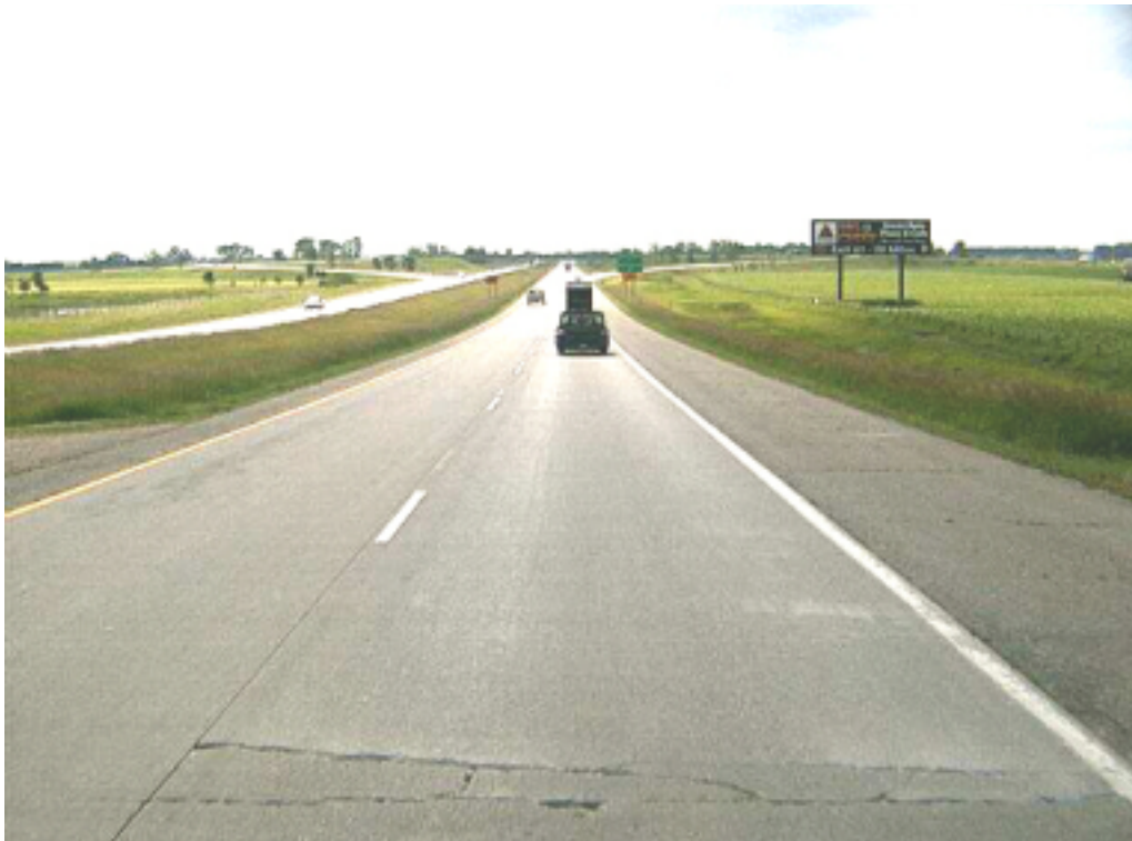
Figure 47. Transverse Crack on CRCP