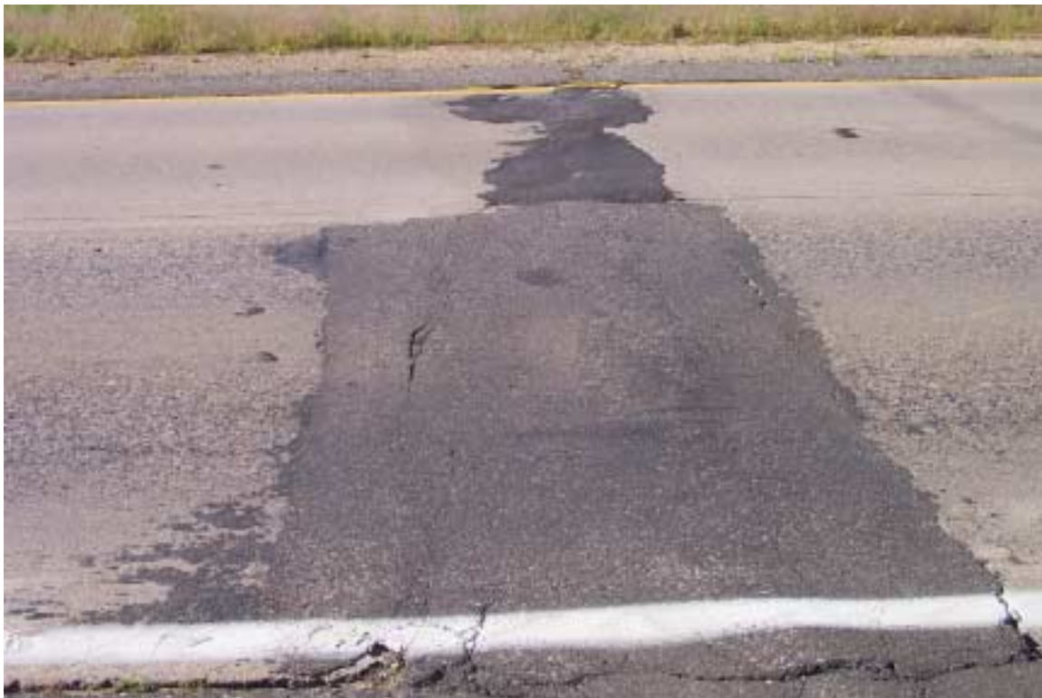
Figure 40. Patched Panels

Record the number of panels or slabs that are patched.