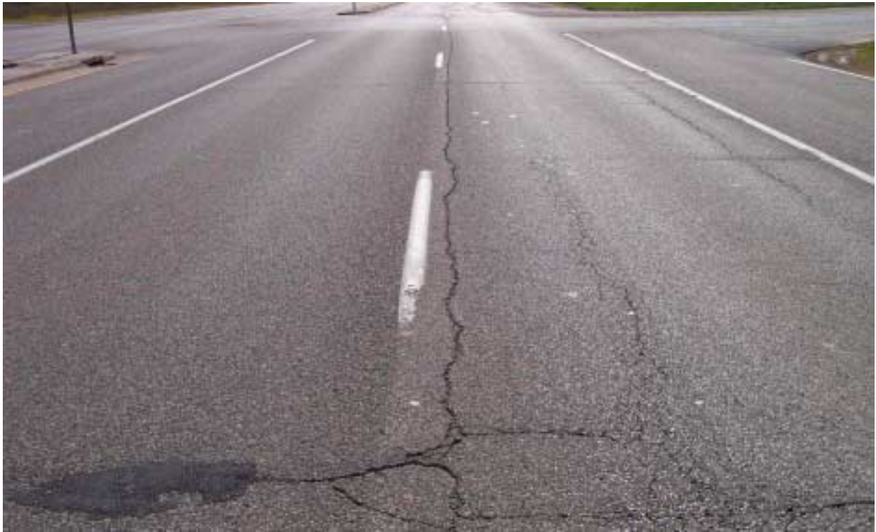
Figure 13. Low Severity Longitudinal Joint Deterioration (no spalling or random cracks)