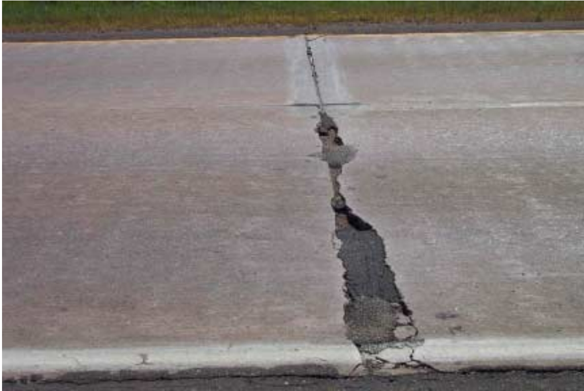
Figure 30. High Severity Transverse Joint Spalling