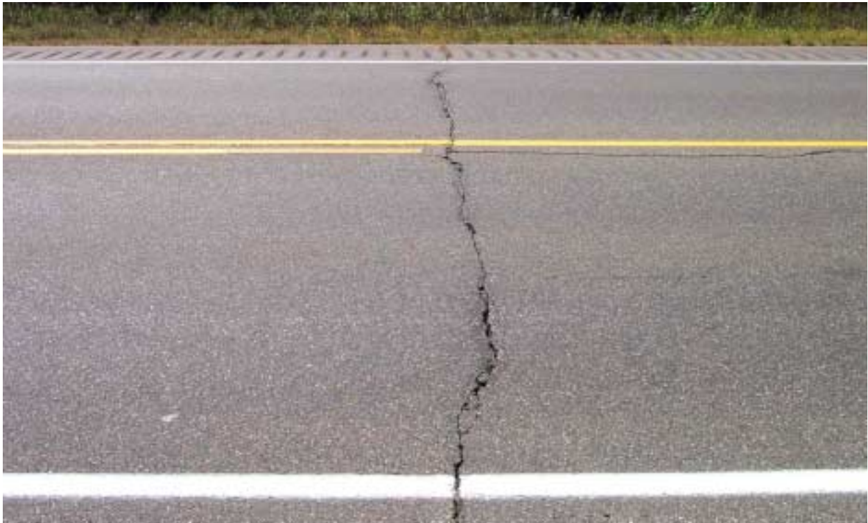
Figure 4. Medium Severity Transverse Crack (some spalling and random cracks)