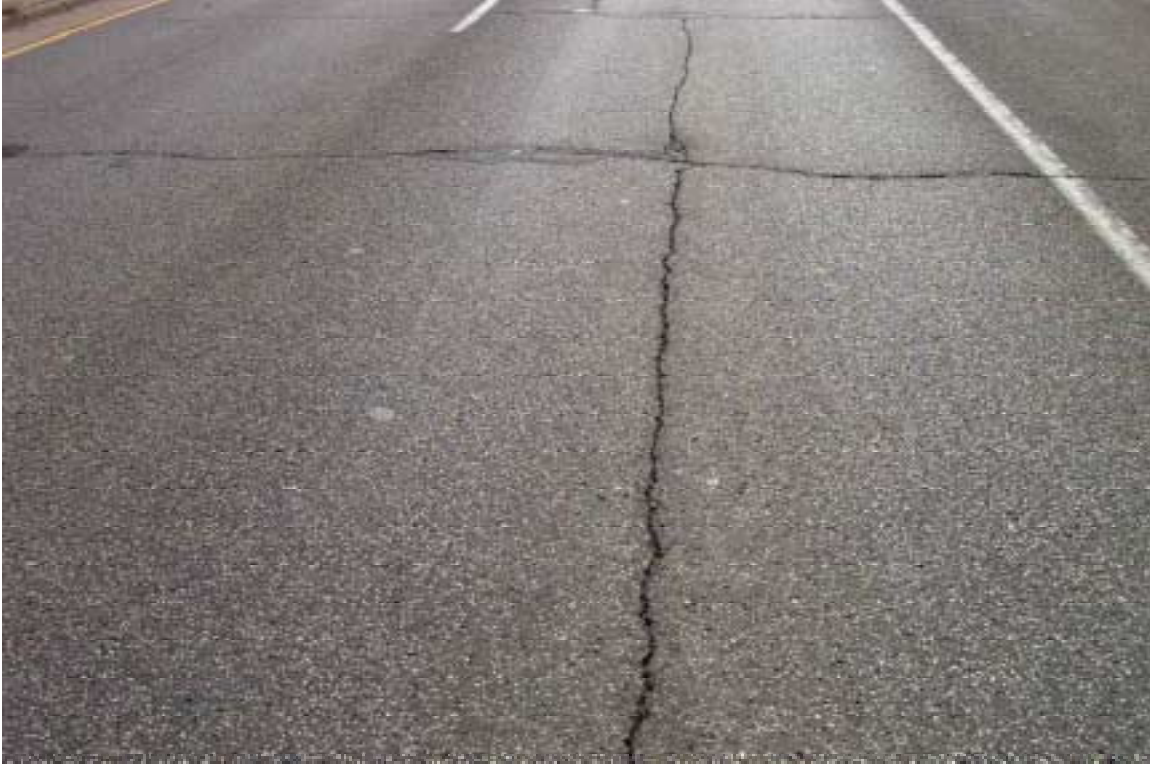
Figure 9. Slight Longitudinal Cracking (no spalling or random cracks)