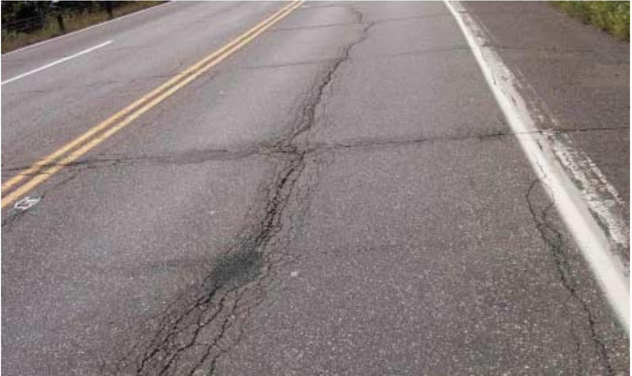
Figure 11. High Severity Longitudinal Crack (random cracks over 12" wide)