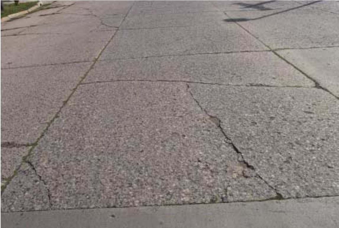
Figure 35. Cracked and Broken Panel