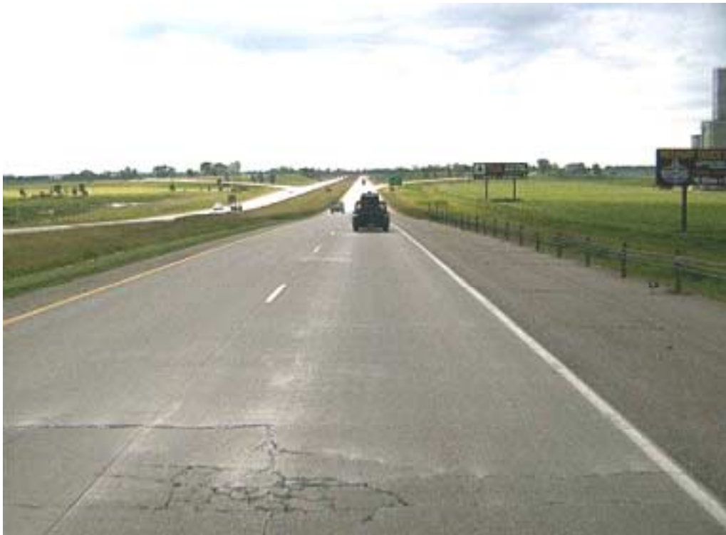
Figure 45. Localized Distress

Record the number of localized distress areas.