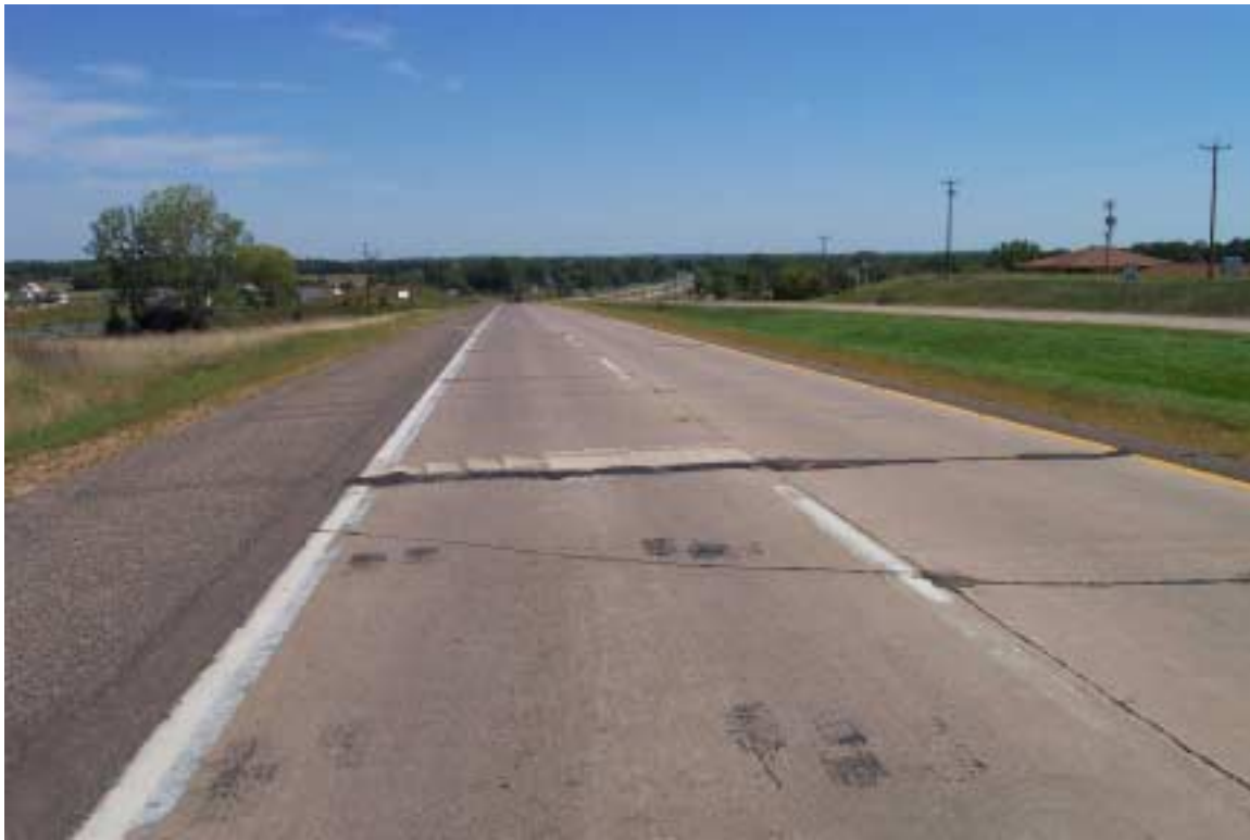
Figure 33. Cracked Panel (slab is divided into two pieces)

Record the number of slabs that are cracked.