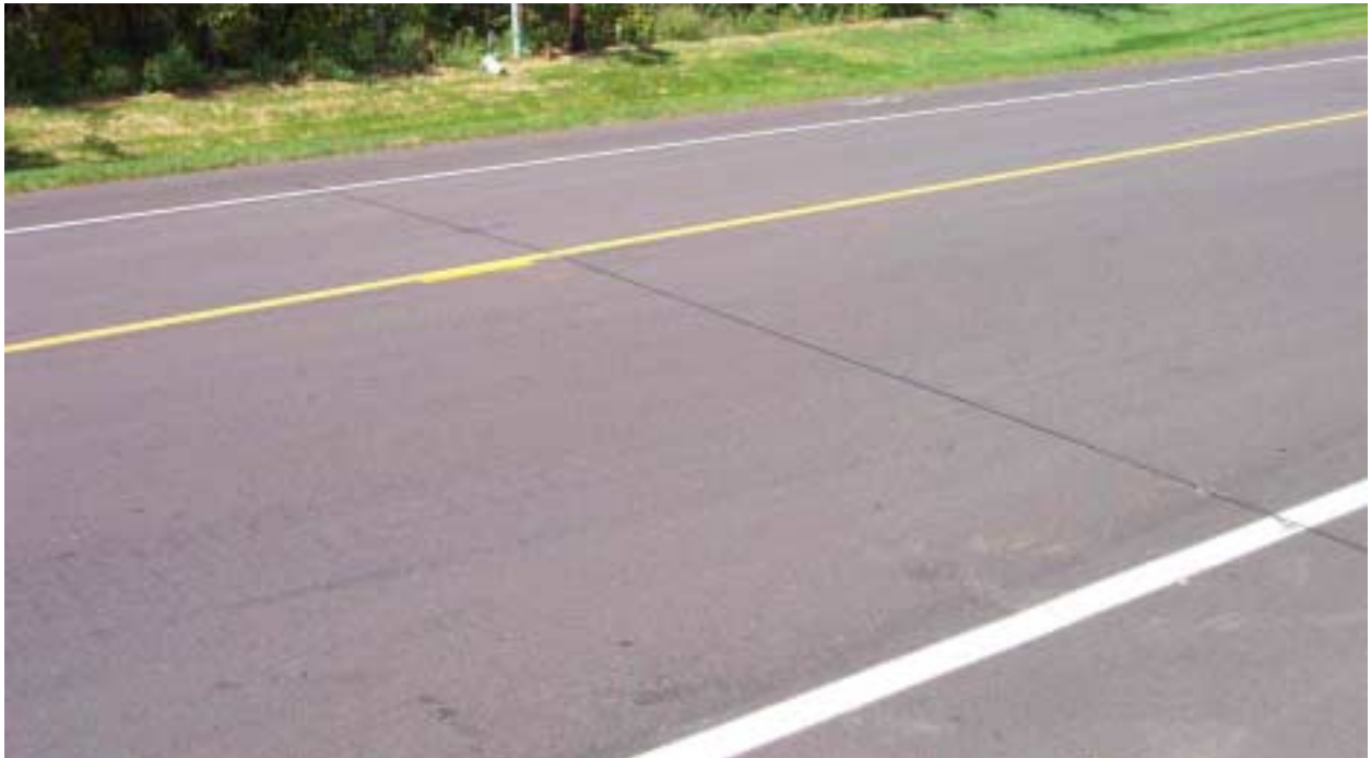
Figure 3. Low Severity Transverse - Saw and Seal