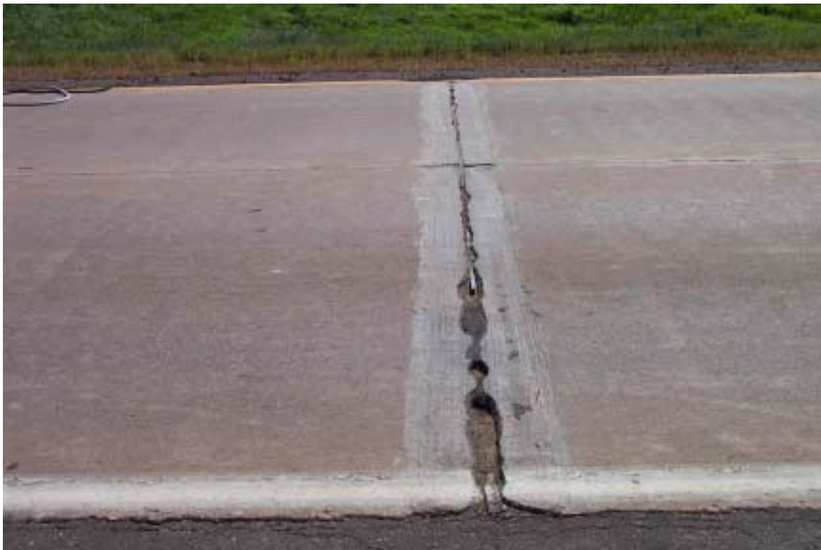
Figure 29. High Severity Transverse Joint Spalling