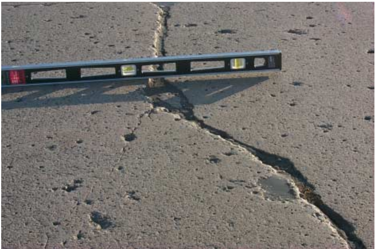
Figure 39. Faulted Panel