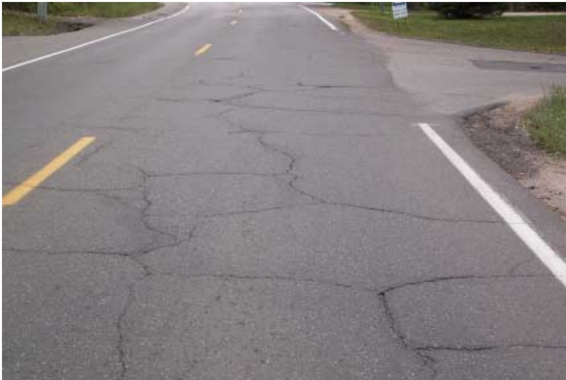
Figure 17. Multiple Cracking

Record the lineal feet of pavement exhibiting multiple cracking.