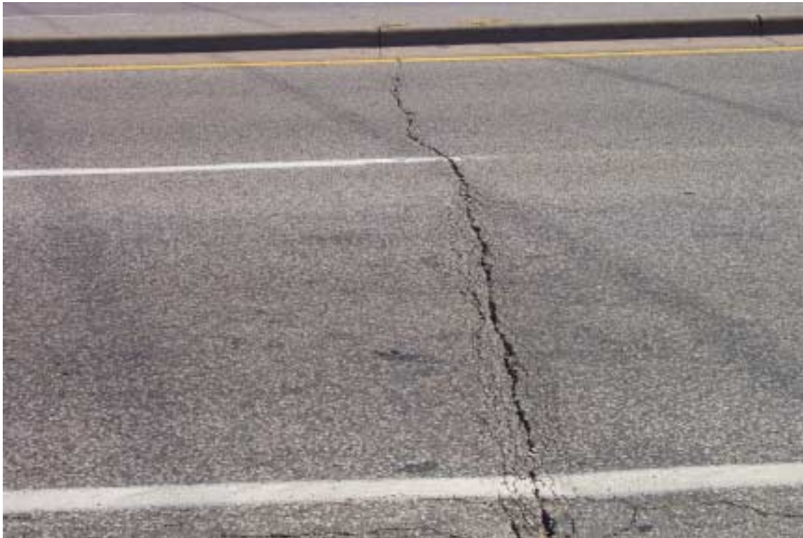
Figure 6. High Severity Transverse Crack (random cracking over 12" wide)