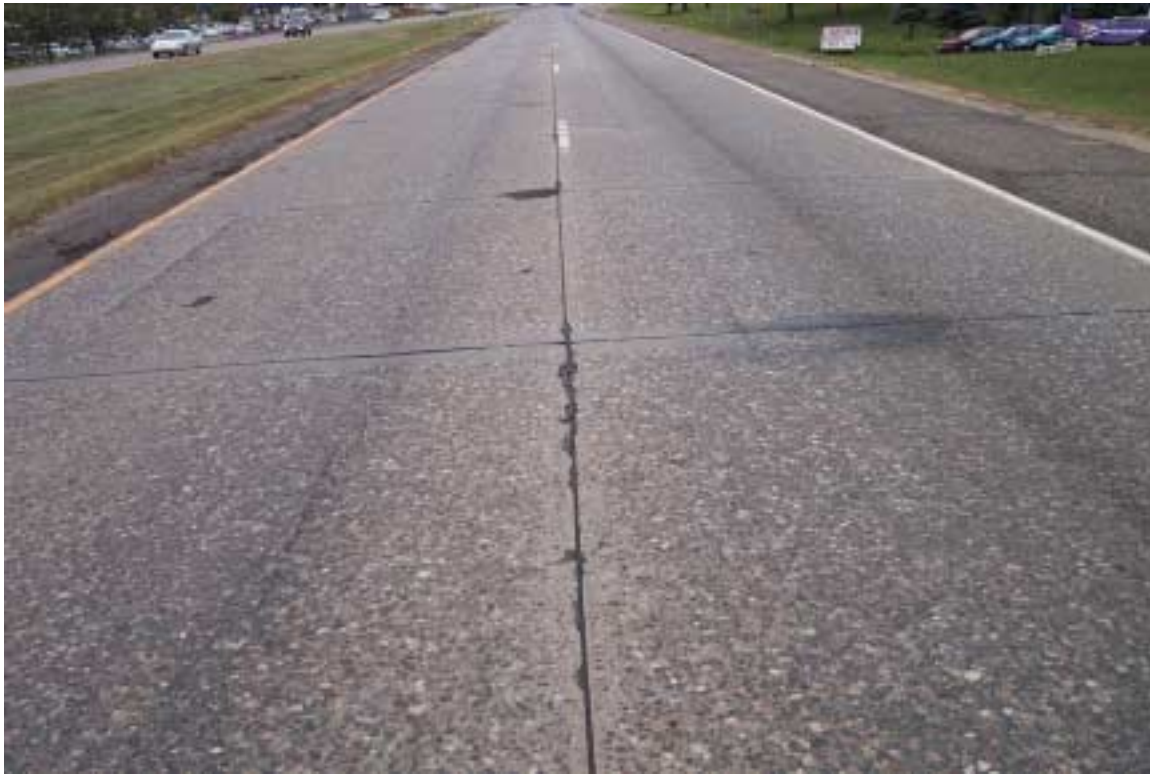
Figure 28. Low Severity Longitudinal Joint Spalling