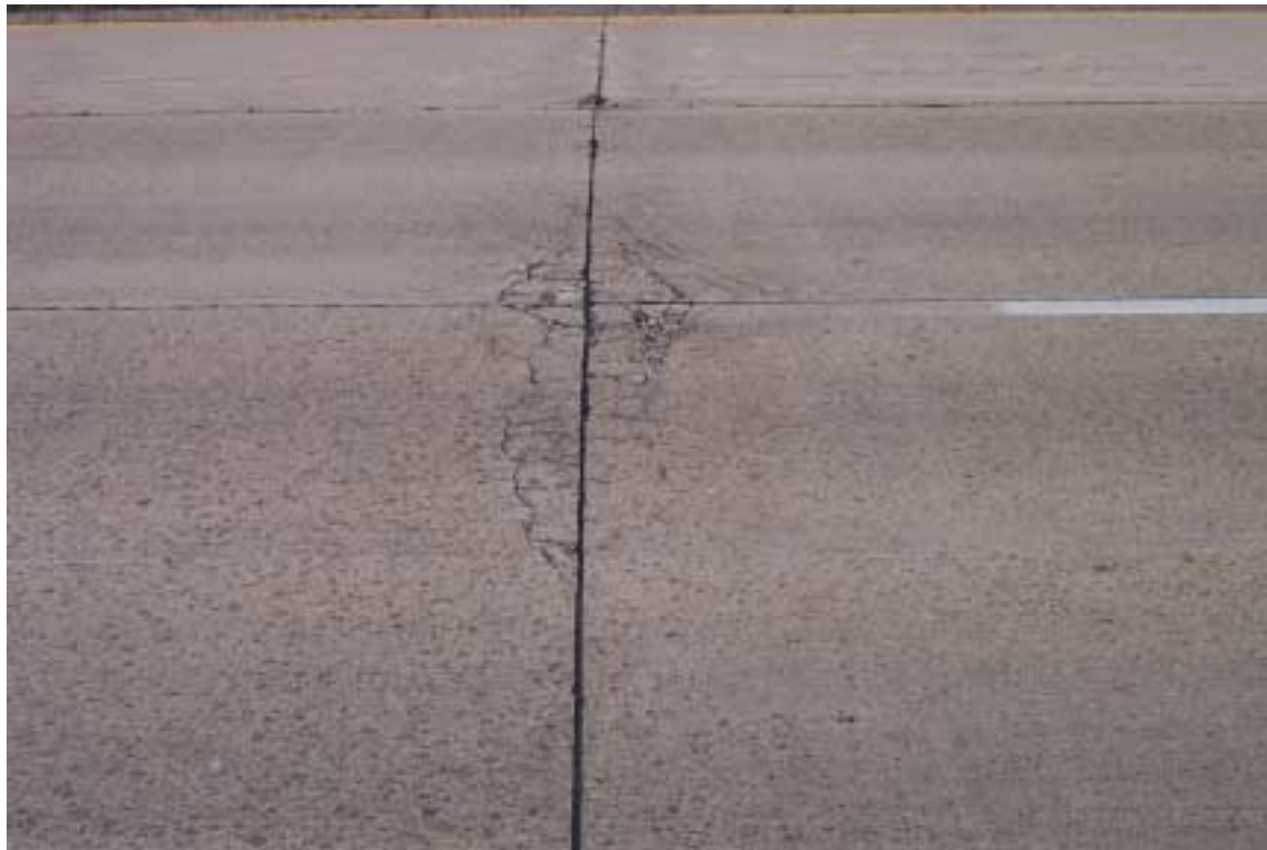
Figure 41. D-Cracking

Record the number of slabs with D-cracking. D-cracking is counted together with spalled joints that occur in the same area.