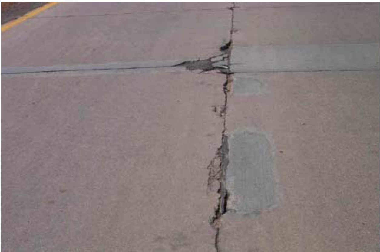
Figure 31. High Severity Longitudinal Joint Spalling