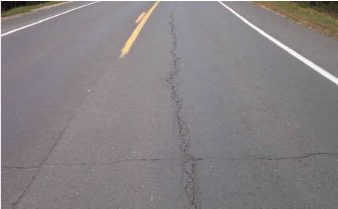
Figure 10. Medium Severity Longitudinal Crack (random cracks are less than 12" wide)