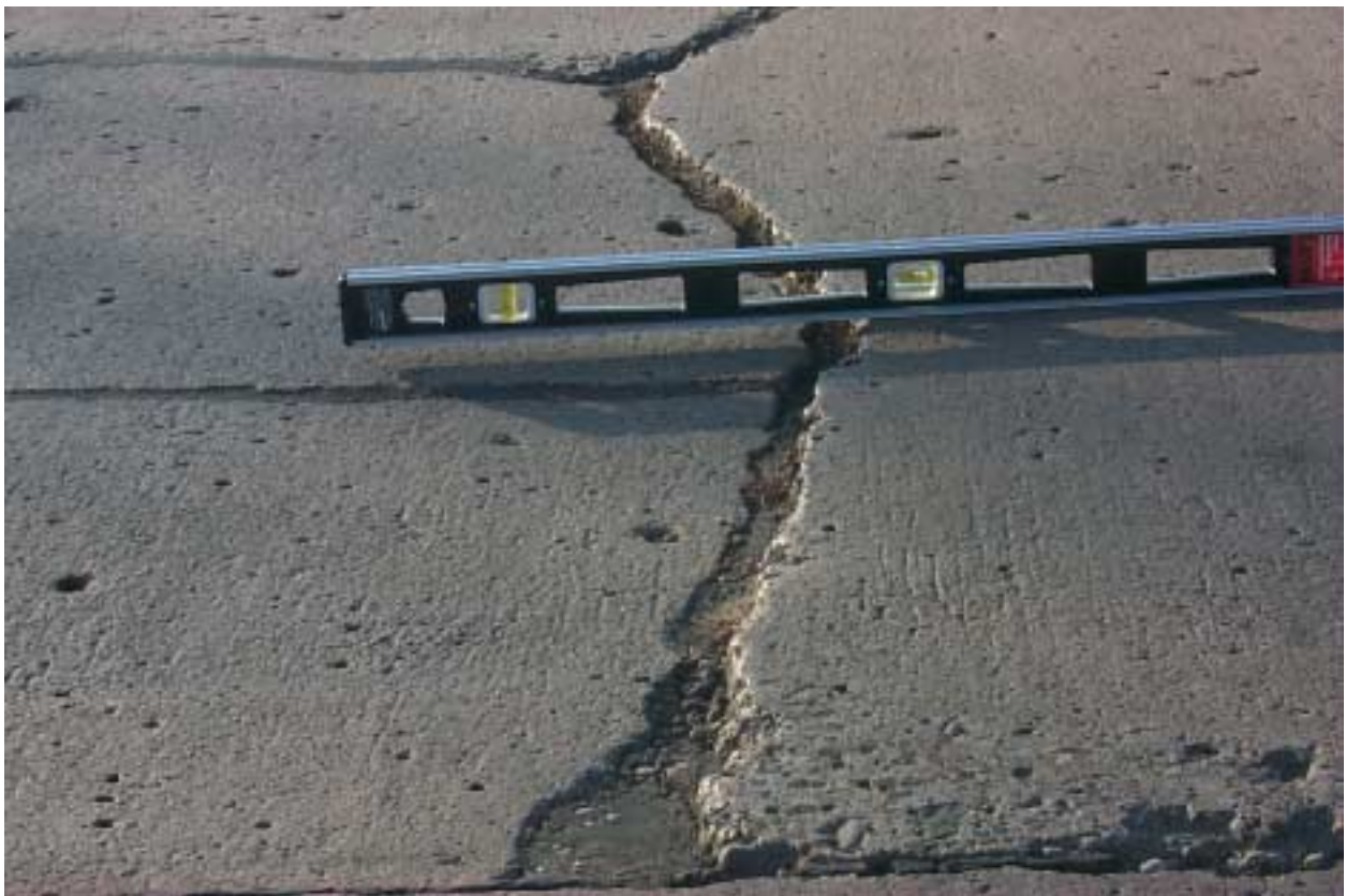
Figure 37. Faulted Panel

Record the number of panels with faulted cracks that exceed the 0.25-inch criteria at any point along its length.