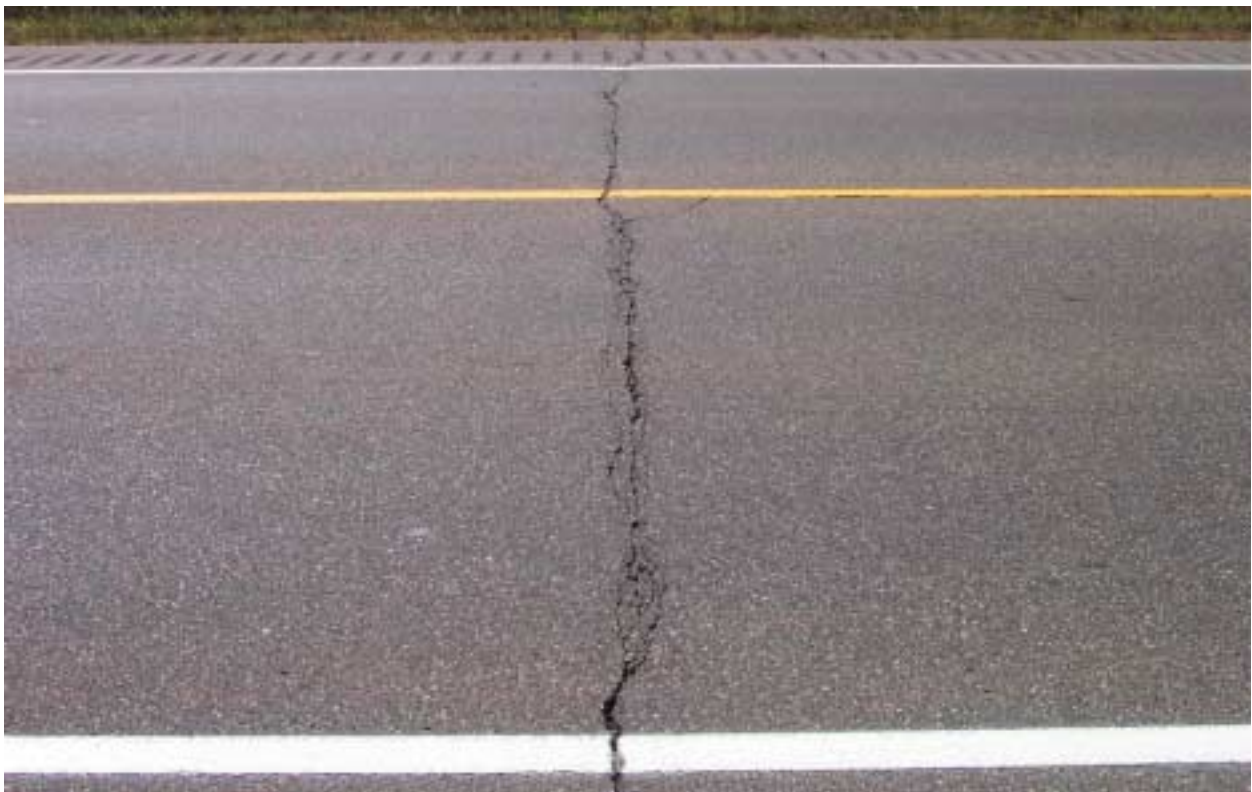
Figure 5. Medium Severity Transverse Crack (some spalling and random cracks)