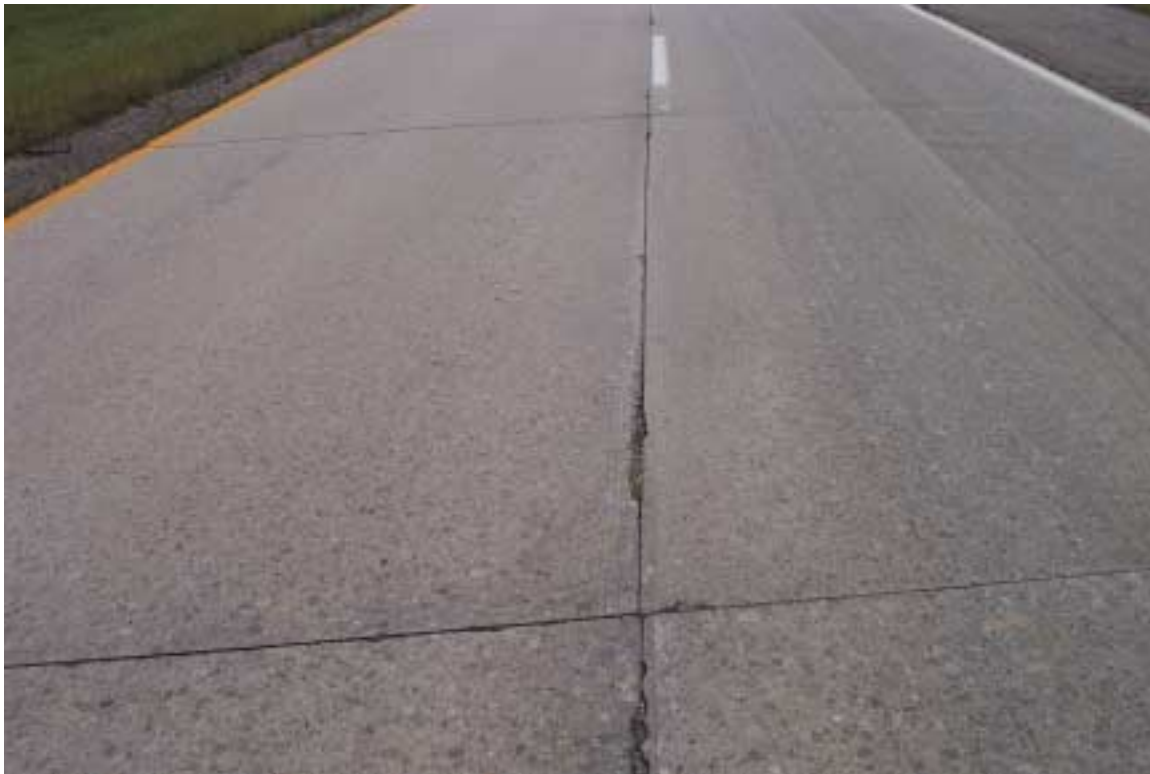
Figure 27. Low Severity Longitudinal Joint Spalling