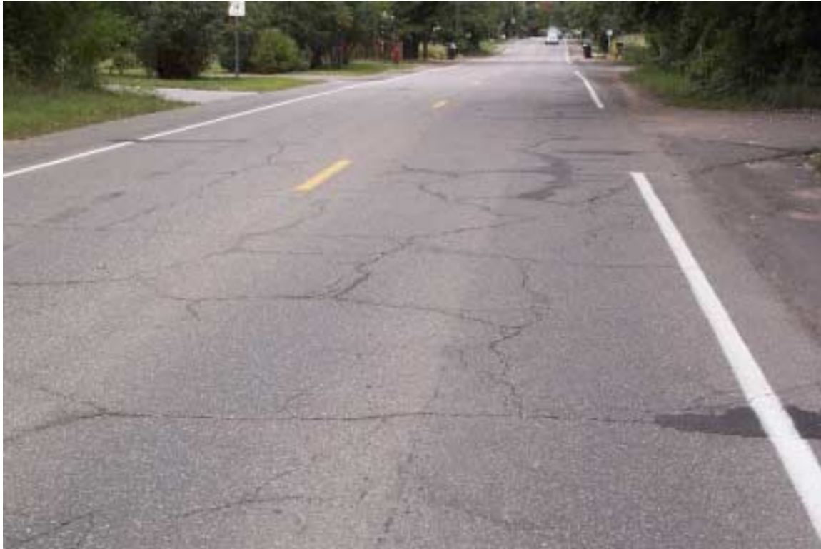
Figure 18. Multiple Cracking