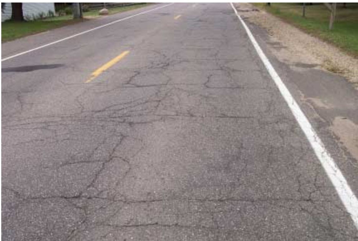
Figure 19. Multiple Cracking