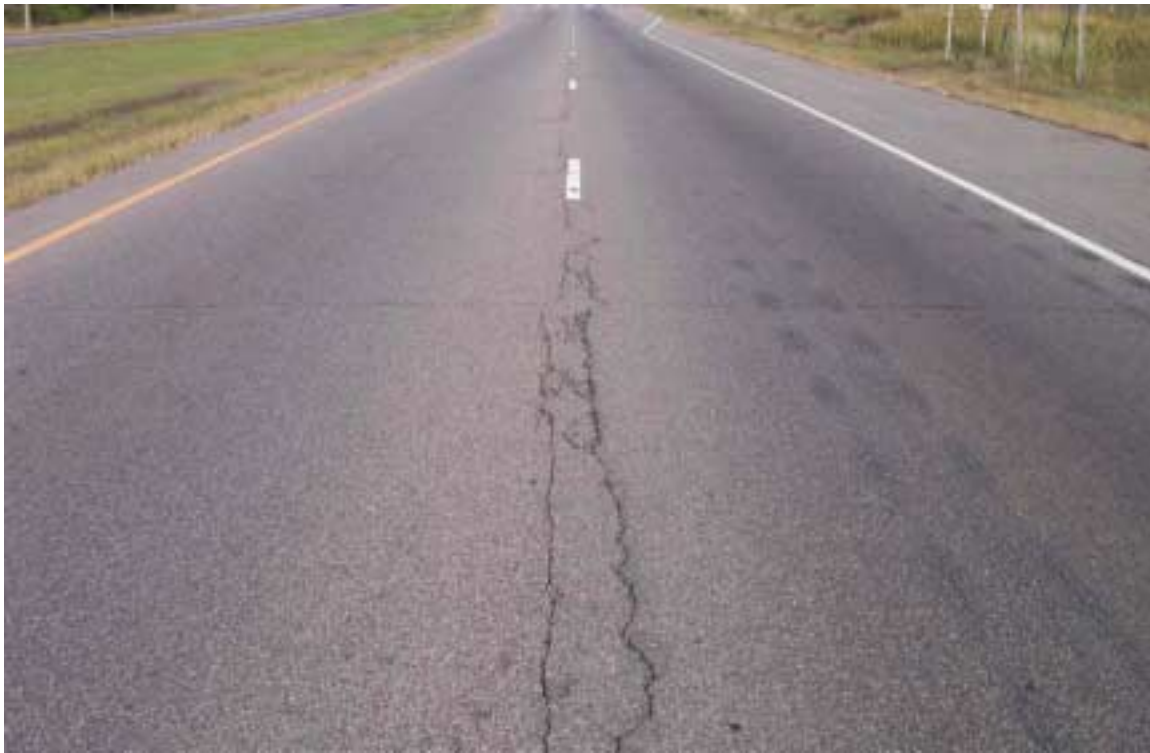
Figure 15. Medium Severity Longitudinal Joint Deterioration (random cracks)