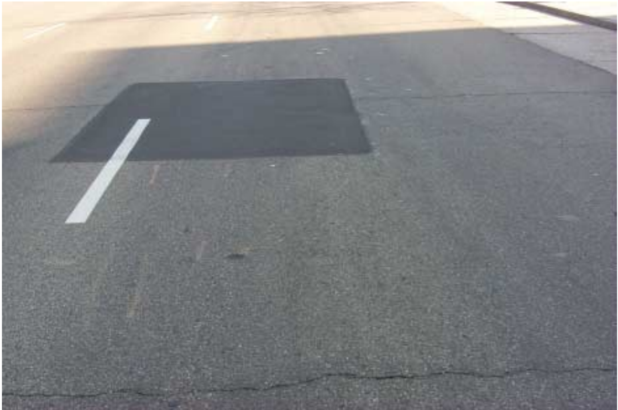
Figure 24. Bituminous Patching

Record the number of lineal feet that is patched. Patching is counted in combination with other deficiencies. However, when a longitudinal deficiency other than low or medium severity longitudinal cracking or longitudinal joint deterioration is observed in the patch, count the longitudinal defect only and not the patch.