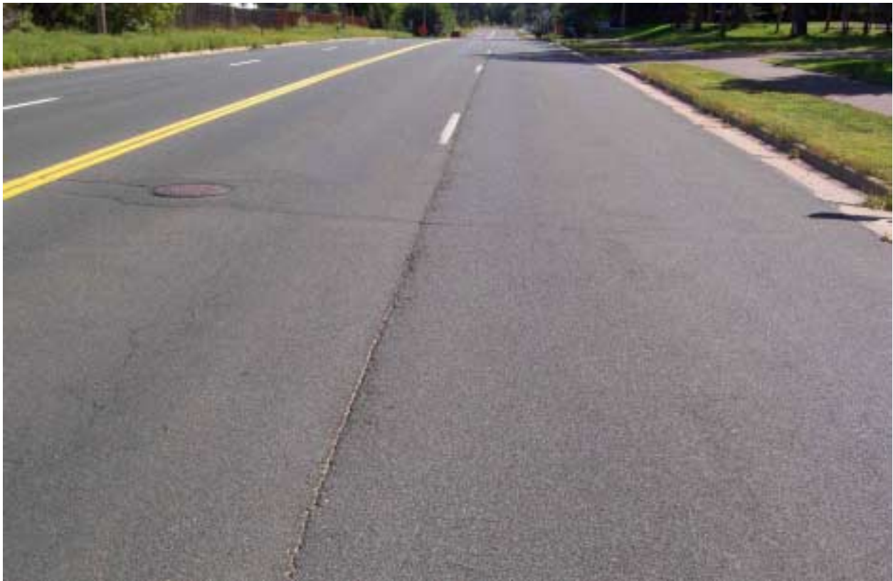
Figure 12. Low Severity Longitudinal Joint Deterioration (no spalling or random cracks)

Record the length, in feet, of longitudinal cracking at each severity level.