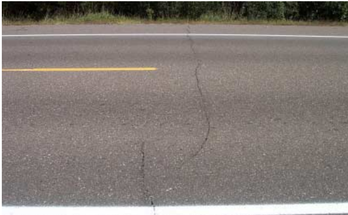
Figure 1. Low Severity Transverse Crack (no random cracks)

Record the number of transverse cracks at each severity level. Rate the entire crack at the highest severity level present for at least 10 percent of the total length of the crack.