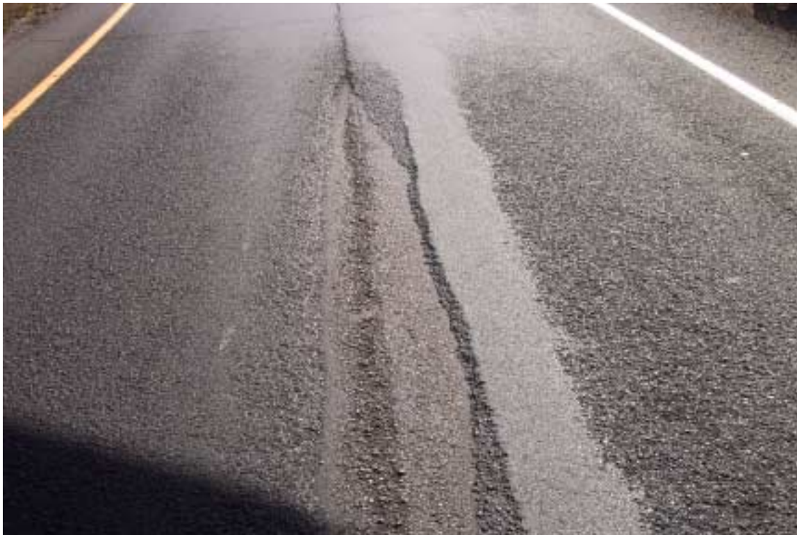
Figure 23. Raveling Under a Bridge

Record the number of lineal feet of pavement exhibiting the conditions listed above.