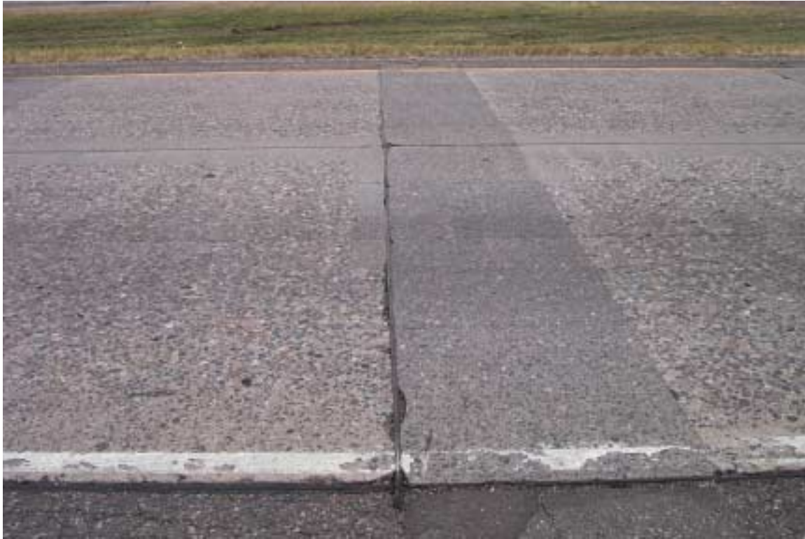
Figure 26. Low Severity Transverse Joint Spalling