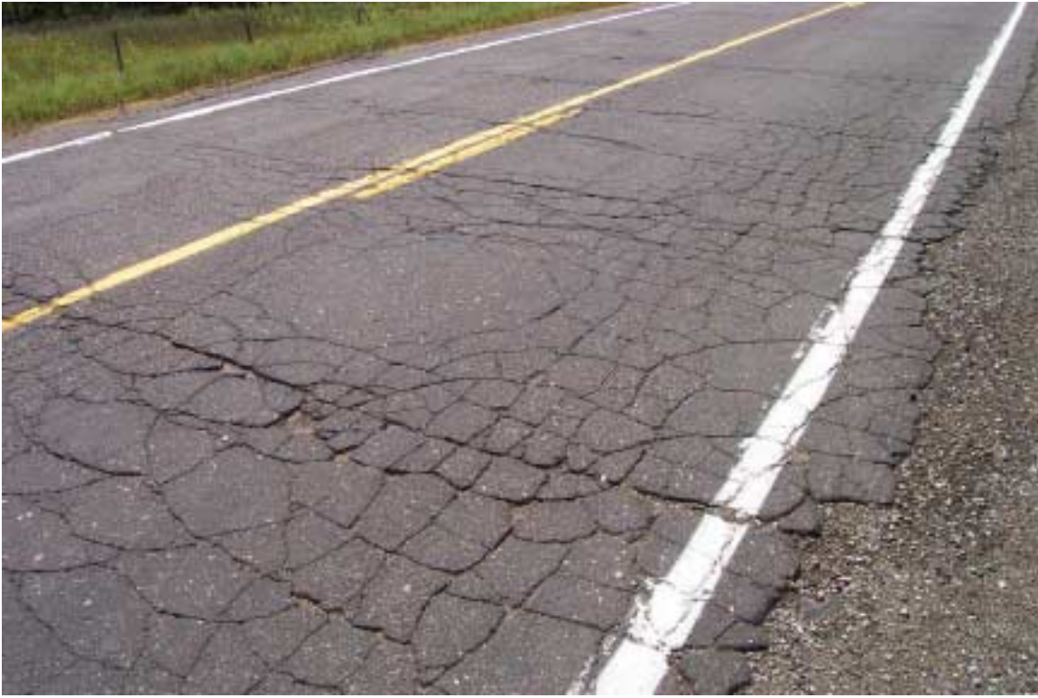
Figure 21. Alligator Cracking