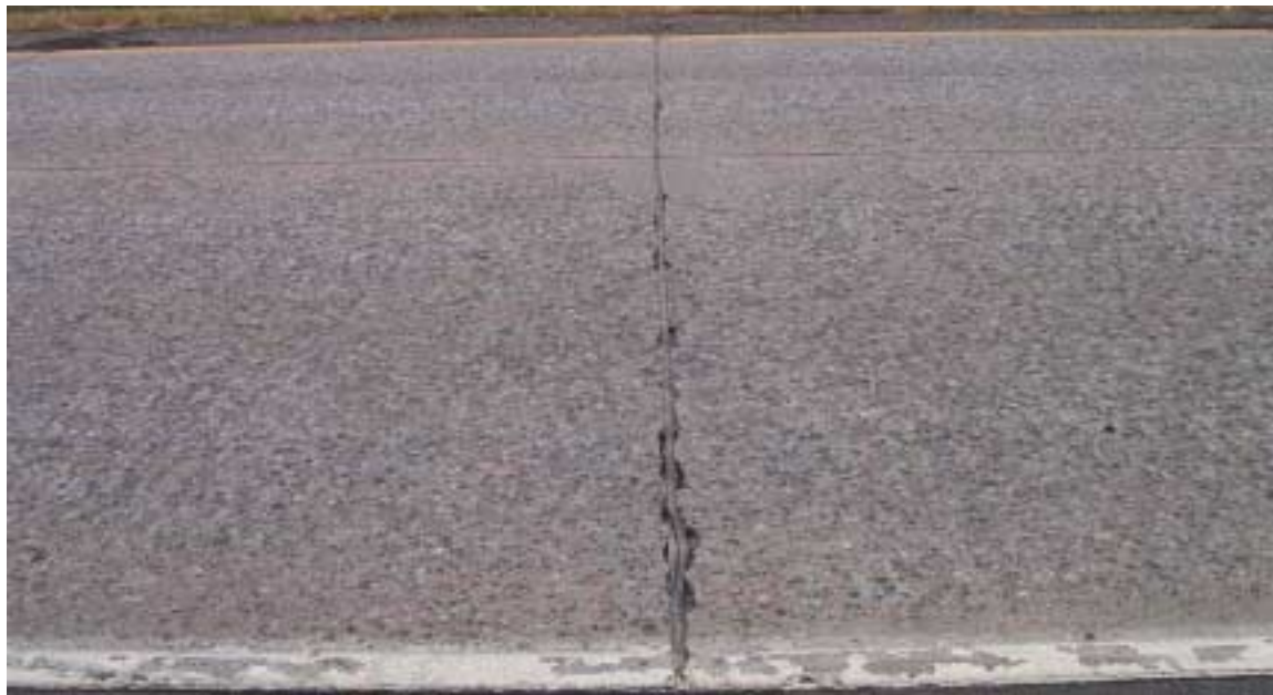
Figure 25. Low Severity Transverse Joint Spalling

Record the number of joints that exhibit Joint Spalling.