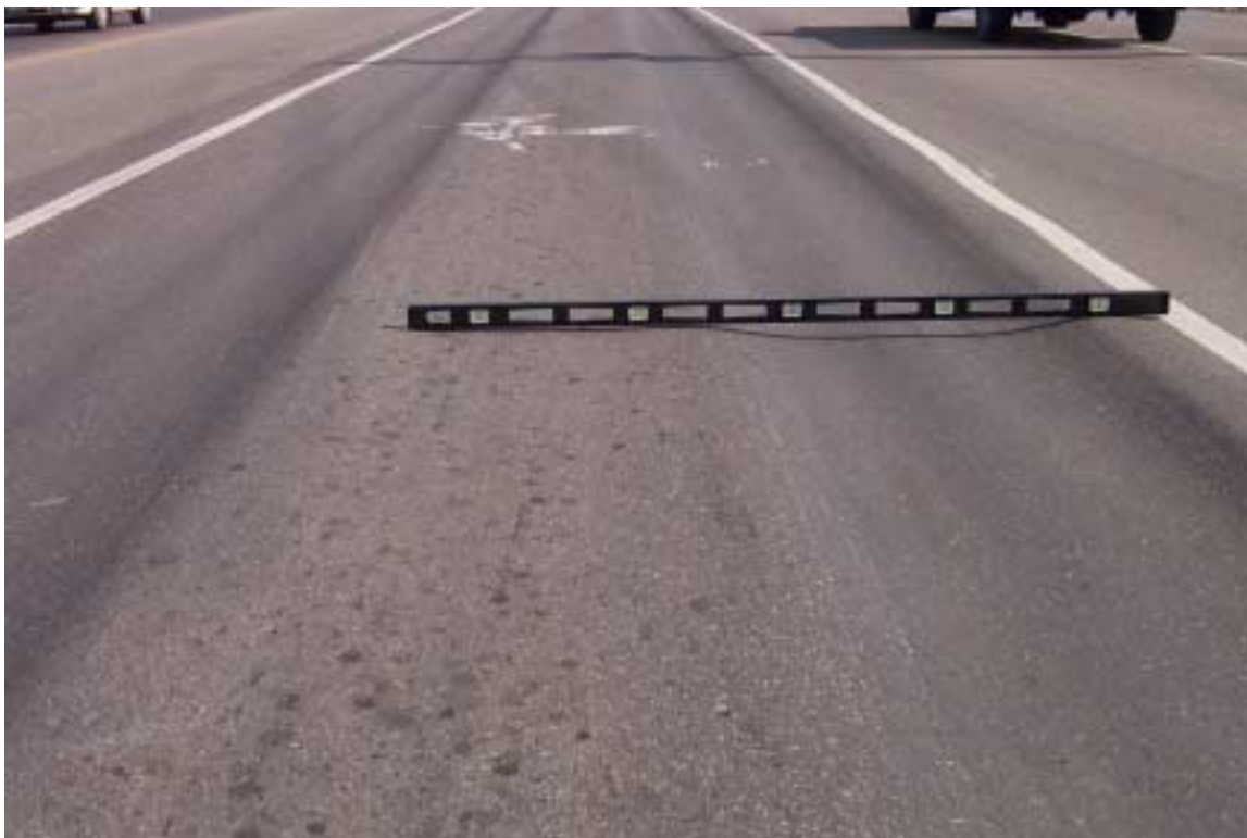
Figure 22. Rutting (0.50 inches or greater)

Record the lineal feet of rutting that exceeds 0.5 inches.