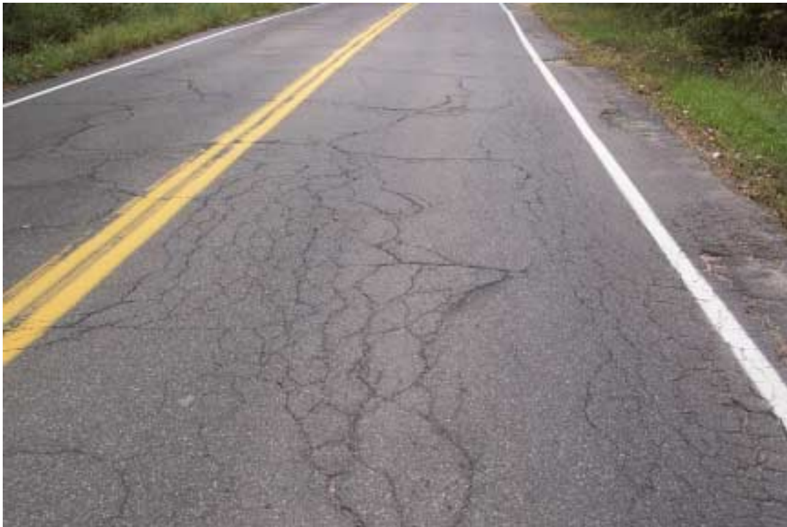
Figure 20. Alligator Cracking

Record the number of lineal feet of pavement with this type of cracking.