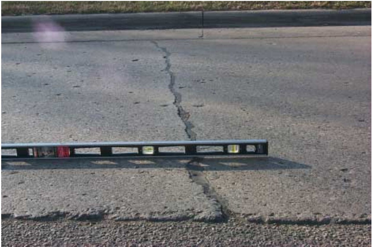
Figure 38. Faulted Panel