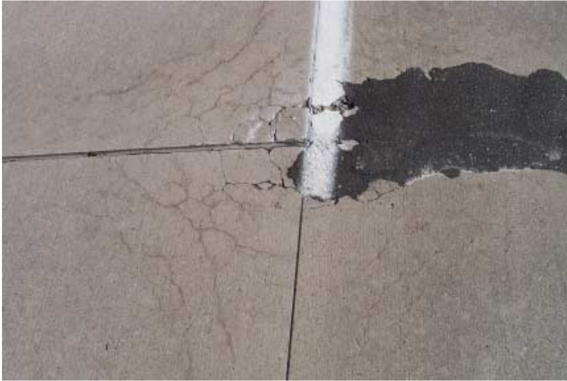
Figure 42. D-Cracking