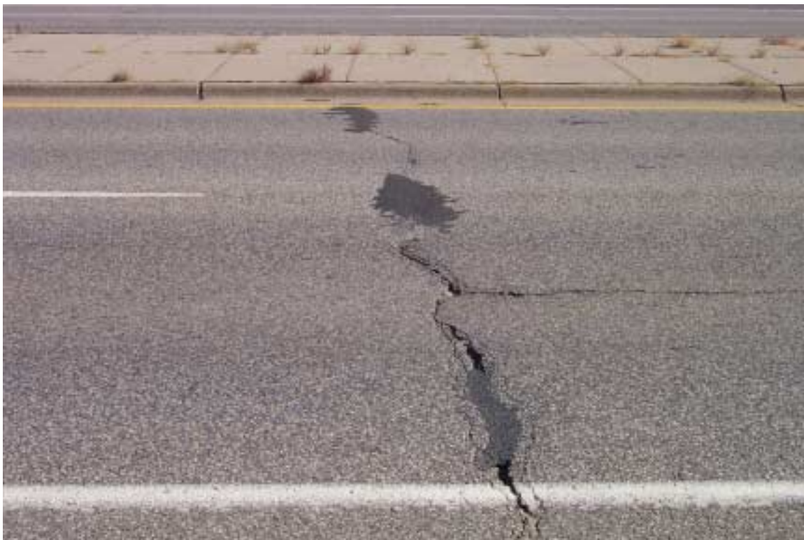
Figure 7. High Severity Transverse Crack (spalling and missing pieces)