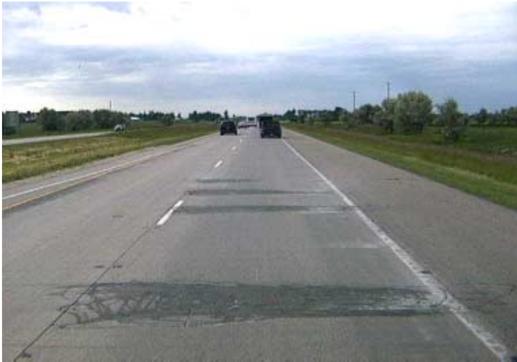
Figure 44. Patch Deterioration

Record the number of lineal feet of patch deterioration.