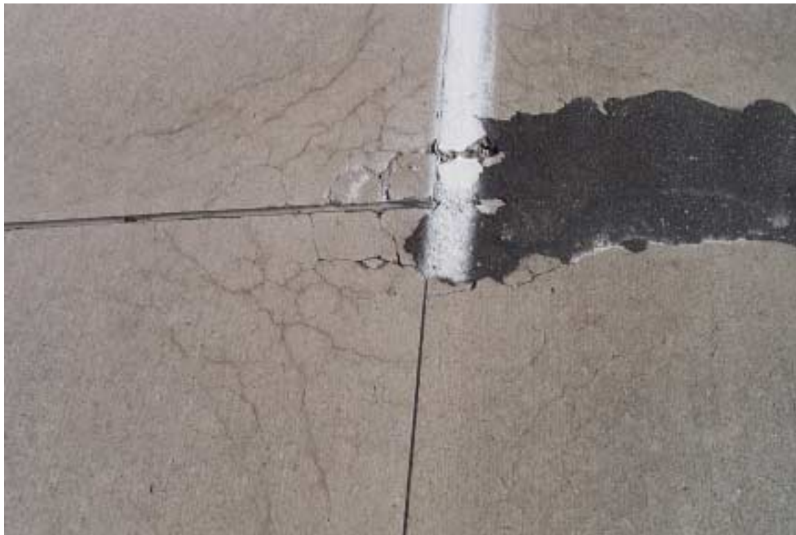
Figure 46. D-Cracking

Record the number of slabs with D-cracking. D-cracking is counted together with spalled joints that occur in the same area.