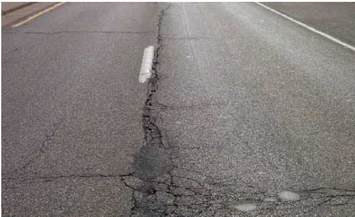
Figure 16. High Severity Longitudinal Joint Deterioration (spalling)