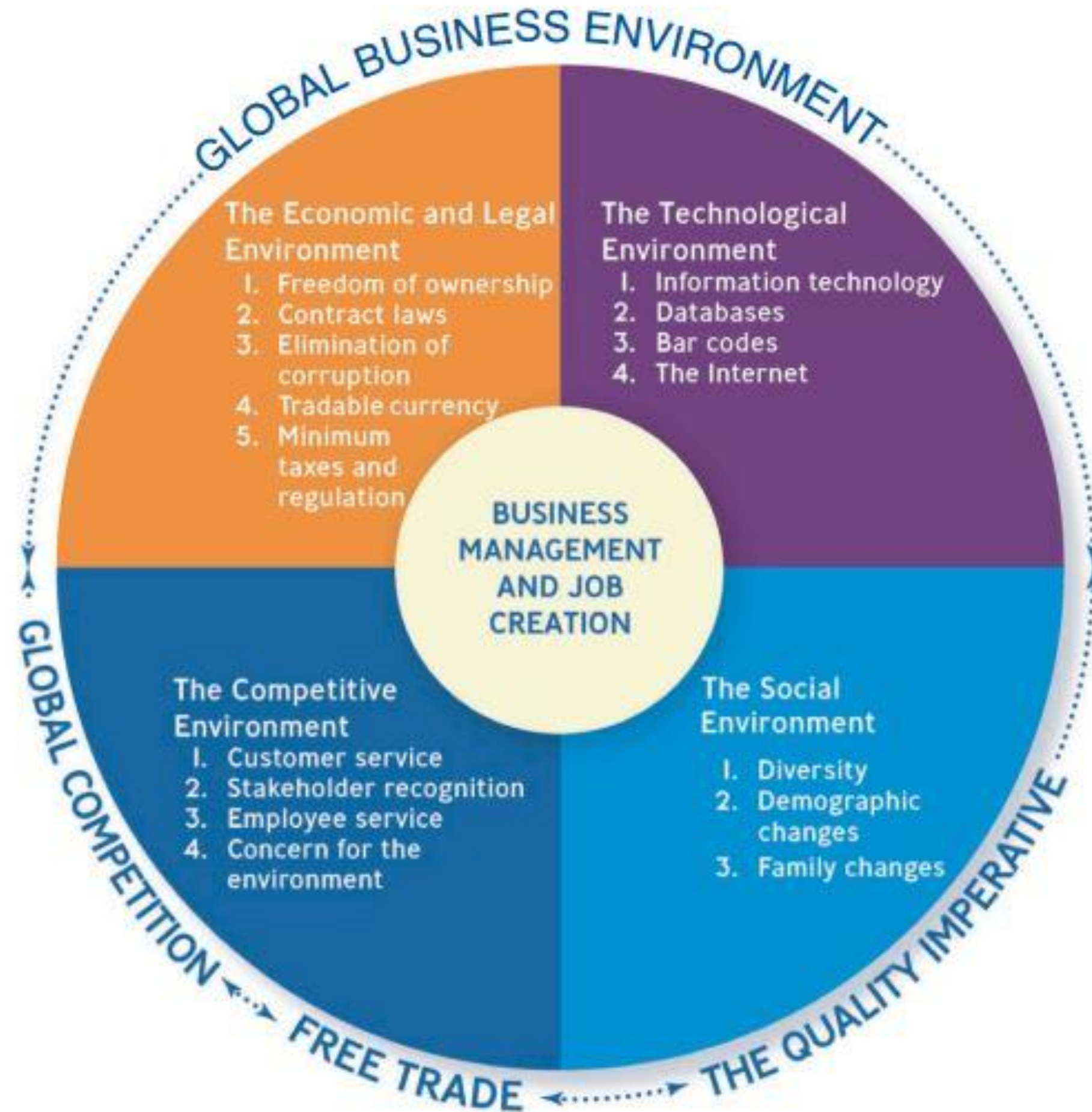
FIGURE 1.3 TODAY'S DYNAMIC BUSINESS ENVIRONMENT