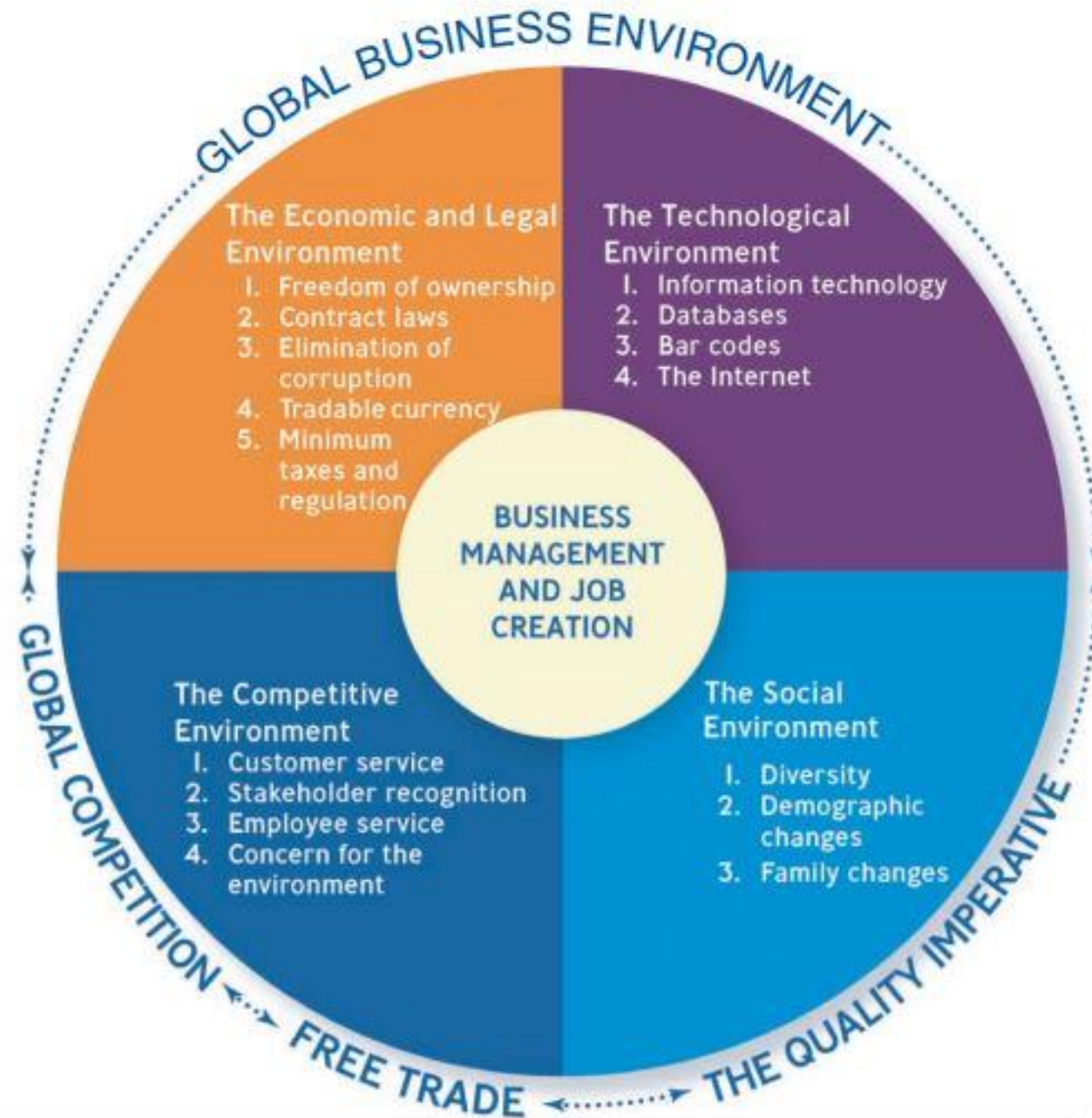
FIGURE 1.3 TODAY'S DYNAMIC BUSINESS ENVIRONMENT